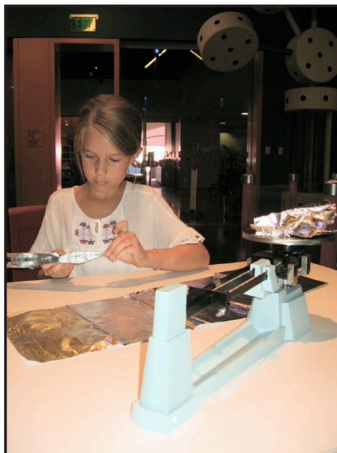
During Chemistry Week 2013, guests were able to explore a unit of measurement called a mole.

Experience a rotating menu of playful and inventive activities.